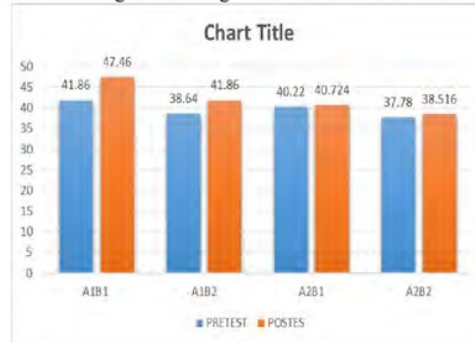
Fig. 1. Block diagram Chart of the average aerobic endurance of athletes age 16 and 18

The results of the counting Statistics of pre test and post test endurance aerobic periodization 4 week and 6 week circuit training with the age of 16 and 18 Ease of Use.